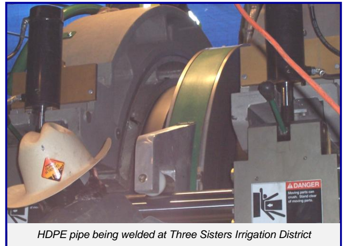
HDPE pipe being welded at Three Sisters Irrigation District

If you or your staff has ideas for future workshops please email them to me.